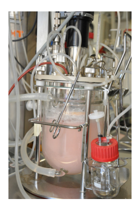
Culture of halophiles in a corrosion resistant bioreactor

The technology relies on halophilic microorganisms for the recycling of waste streams. Halophilic microorganisms are capable of growing on a wide variety of carbon sources. They are reported to grow on different organic acids, diverse sugars, the sugar alcohol glycerol and even aromatic compounds, among others. In addition they are producing secondary metabolites like carotinoids or bioplastics and they could even be used for the production of recombinant products. The technology deals with defined medium and - as salt have to be added to the waste stream - with a corrosion resistant bioreactor.