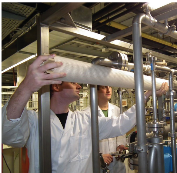
Three-stage pilot system (RO/NF/NF) with five 4“ membrane modules

In this process, membranes with lower retention capacities are deliberately used, so that the osmotic pressure difference can be controlled very precisely at every stage and lower process operating pressures of as low as 40 bar are sufficient. With intelligent recovery of the separated flows of recyclable materials into the upstream process steps, loss of valuable material is minimised. Water is only discharged in the reverse osmosis stage. As a result of the low process temperature – in comparison to the evaporation method – product quality increases. The number of stages can be adapted depending on the requirements for the concentration.