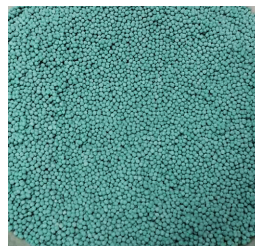
Figure 2: \text{CuSO}_4 on zeolithe