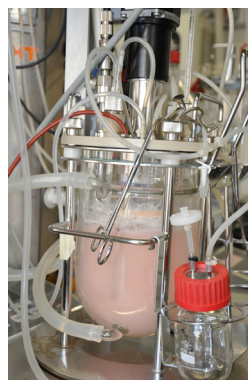
Culture of halophiles in a corrosion resistant bioreactor

The technology relies on halophilic microorganisms for the recycling of waste streams. Halophilic microorganisms are capable of growing on a wide variety of carbon sources. They are reported to grow on different organic acids, diverse sugars, the sugar alcohol glycerol and even aromatic compounds, among others. In addition they are producing secondary metabolites like carotenoids or bioplastics and they could even be used for the production of recombinant products. The technology deals with defined medium and - as salt have to be added to the waste stream - with a corrosion resistant bioreactor.